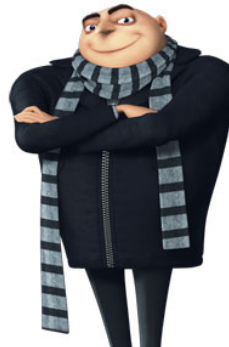
Gru Gg, ff, Ss, BB